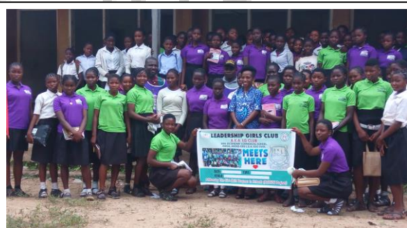
Cross Section of beneficiaries with TYDF at Flag Off of the Project