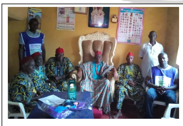
Meeting with some members of Imoga Traditional Council after a talk on the ills of irregular migration and trafficking in persons