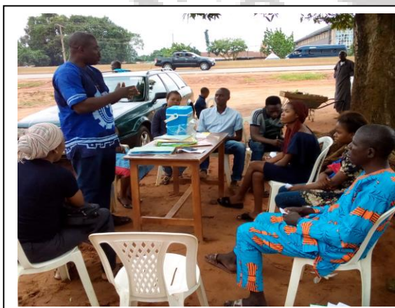
Quarterly Review meeting with DOTs, LGTBLS, Patients and TSs