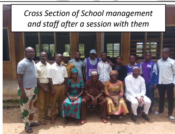
Cross Section of School management and staff after a session with them