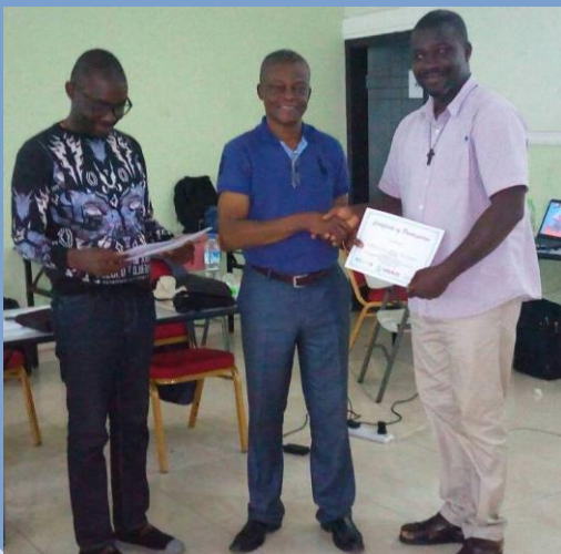
Receiving a certificate as a CSO Project Monitor for the Trainers