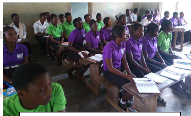
Cross Section of beneficiaries during the Class Room Session

Josemaria Escriva Foundation implemented a project aimed at addressing the “Dropout” Syndrome among secondary school girls in Imoga community, Akoko Edo Local Government of Edo State through Enhancing Education and Mentoring. Direct target beneficiaries were 48 girls and about 150 girls benefit indirectly. This project was sponsored by TY Danjuma Foundation and lasted from February - December, 2018.