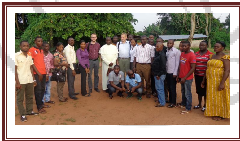
After a FGD session with JDPC, Facilitators and JDPC Funders