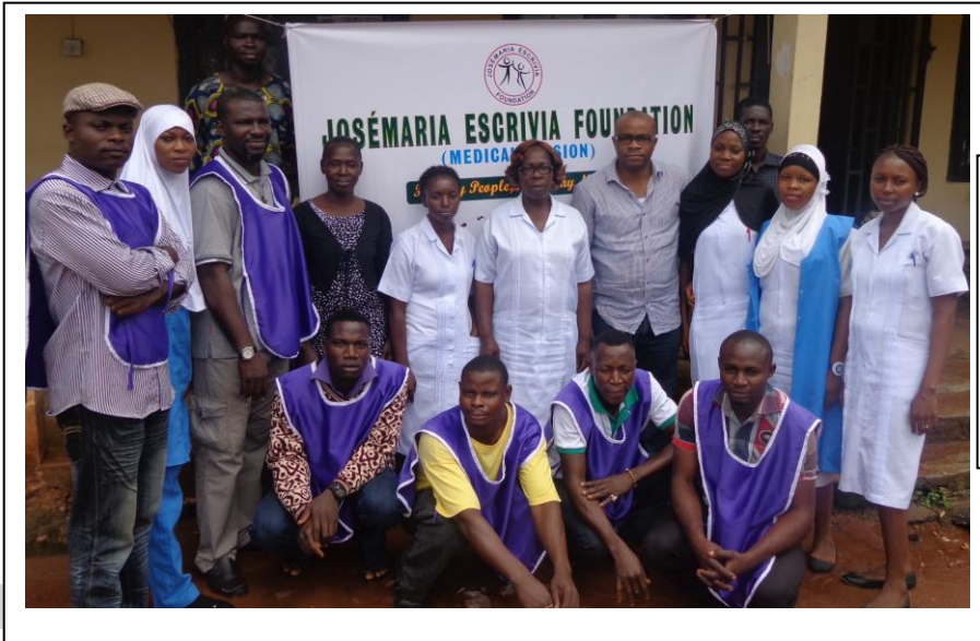
Members of JOSEf Medical Team after an intervention in Imoga, Akoko Edo LGA