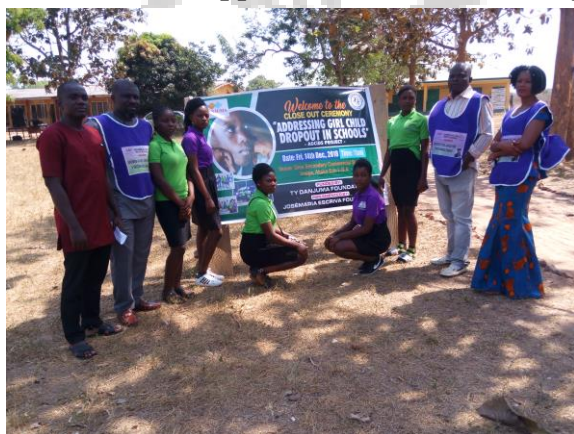
Exco of the Leadership Girls Club, TYDF and JOSEF Project Team