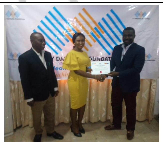
CRO receiving certificate of completion of Project